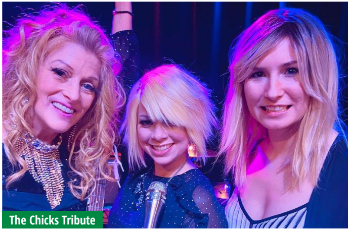
The Chicks Tribute